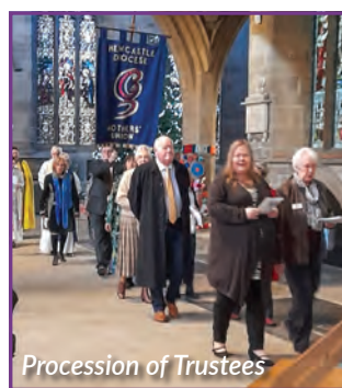
Procession of Trustees