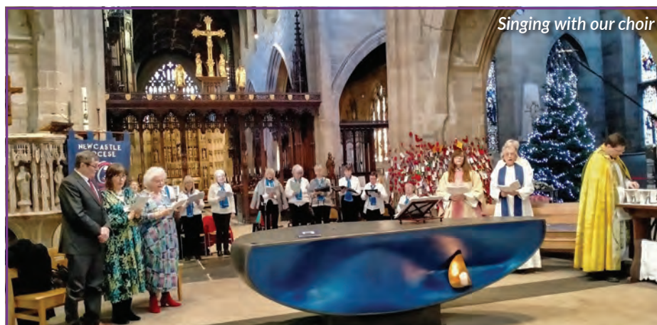
Singing with our choir