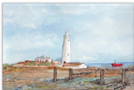
"TAKE ME OUT TO SEA"