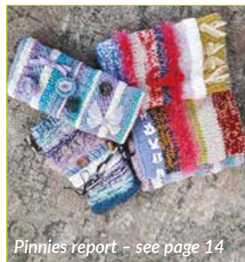
Pinnies report - see page 14

The charity is 100% volunteer led, all monies raised go into the many projects Mothers' Union develop and deliver. If you would like to contribute to the work that Mothers Union is active in both in Newcastle Diocese and Worldwide you can contribute to our Virgin Giving site http://uk.virginmoneygiving.com/charity-web/charity/ finalCharityHomepage.action?charityId=1008779