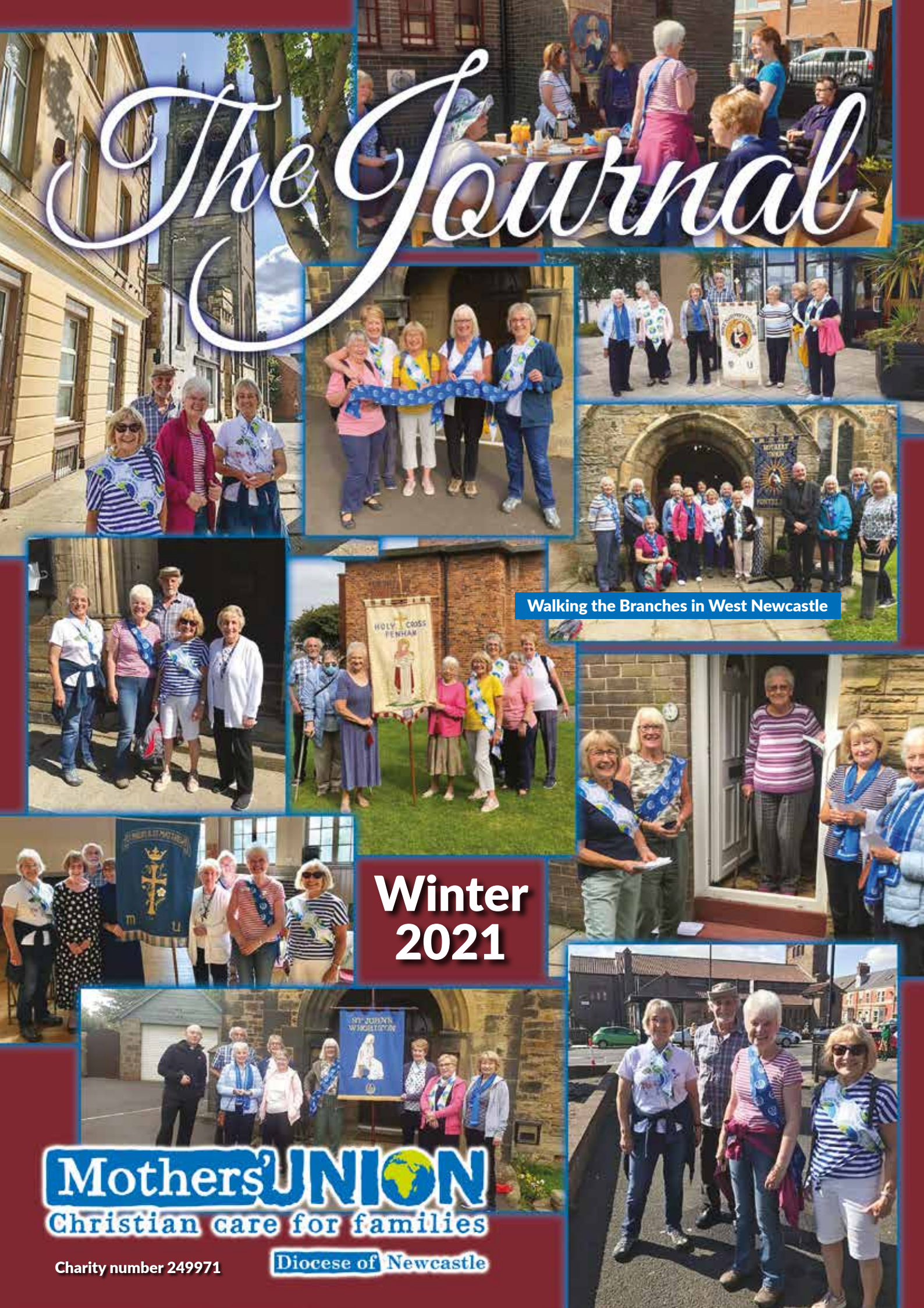
Walking the Branches in West Newcastle