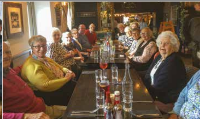
Cambois branch welcomed two new members at its first face to face meeting for months, and also shared with neighbouring branch Choppington in a meal at the Half Moon.